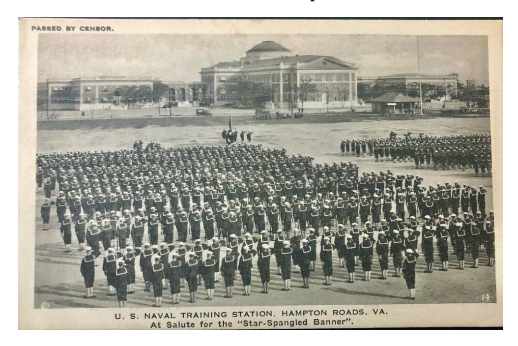
U.S. Naval Training Station Hampton Roads circa 1918